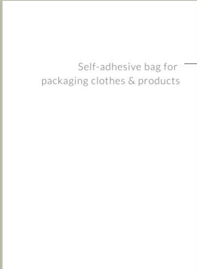
Self-adhesive bag for packaging clothes & products