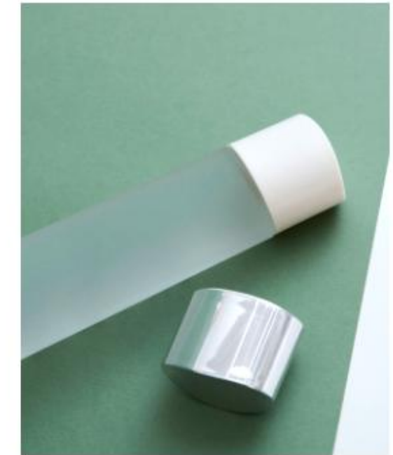
Cap & Lid