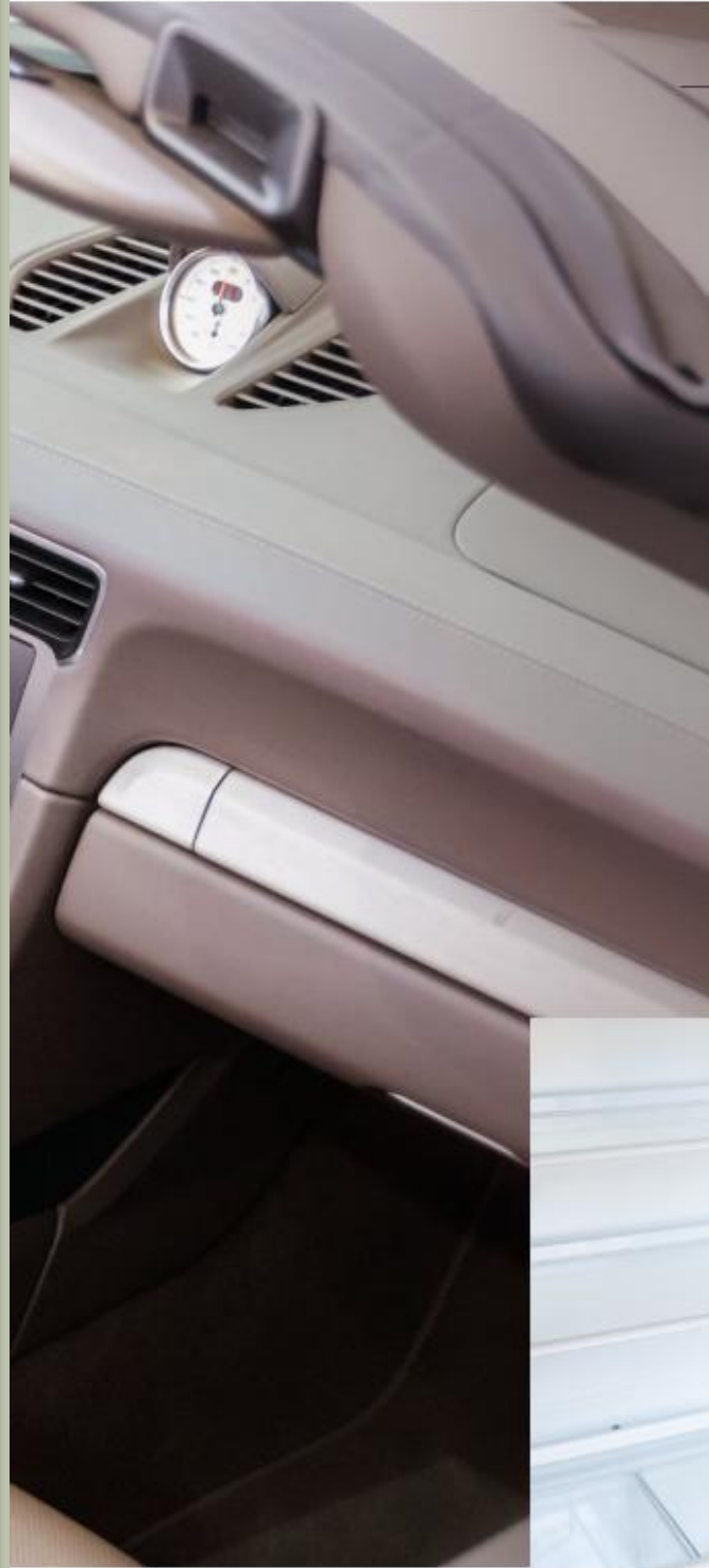
Plastic parts that currently make up 50% of automobiles by volume