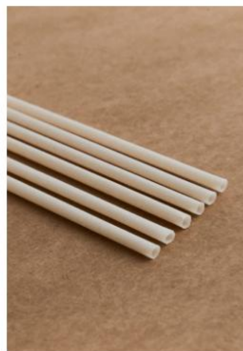
Straw (Straight or Bent)