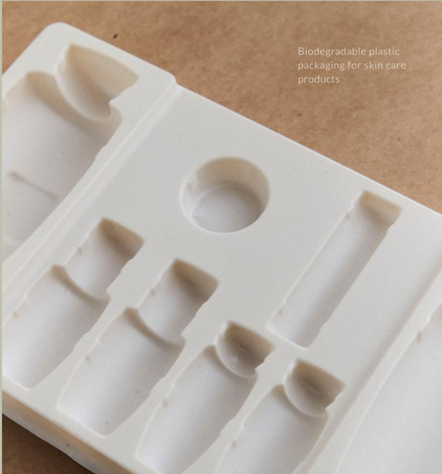
Biodegradable plastic packaging for skin care products