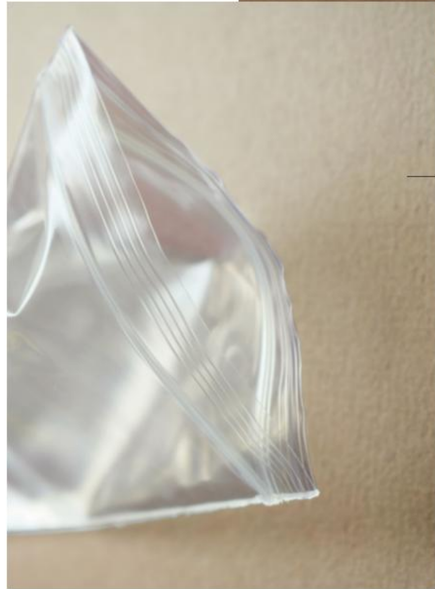
Resealable zip seal bags