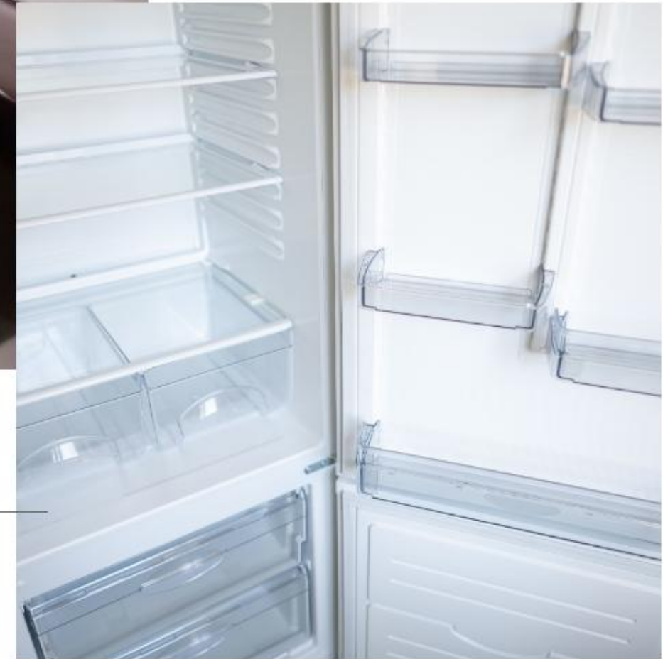
Plastic parts for household appliances