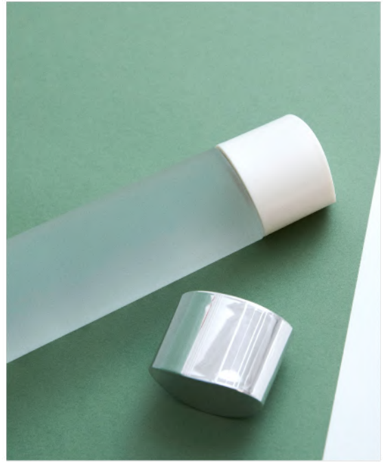
Cap & Lid