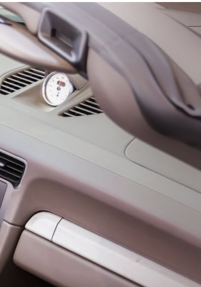
— Plastic parts that currently make up 50% of automobiles by volume