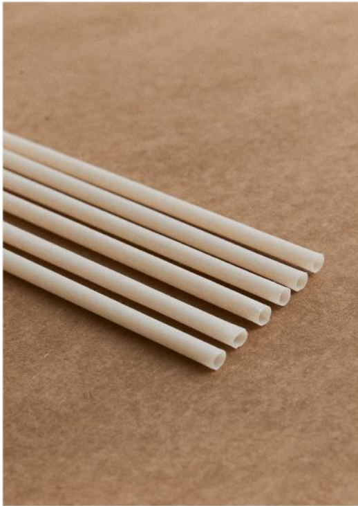
Straw (Straight or Bent)