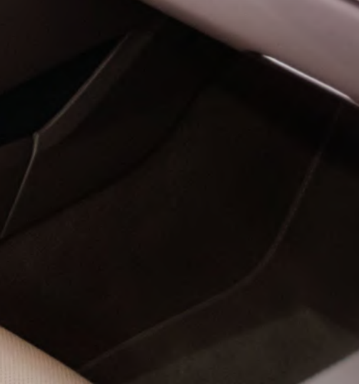
— Plastic parts for household appliances