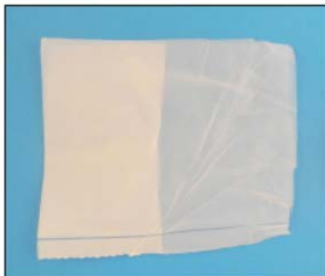
Figure 1. Visual presentation of a 10 cm x 10 cm piece of test item PMP-BIO 03

A visual presentation of test item PMP-BIO 03 (Plastic bag) is given in Figure 1.